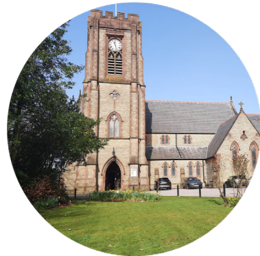
St Paul's Church Railway Road, Adlington, Chorley PR6 9QZ