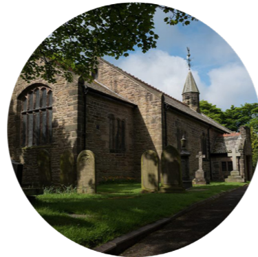
Rivington Church Horrobin Lane, Rivington, Bolton BL6 7SE