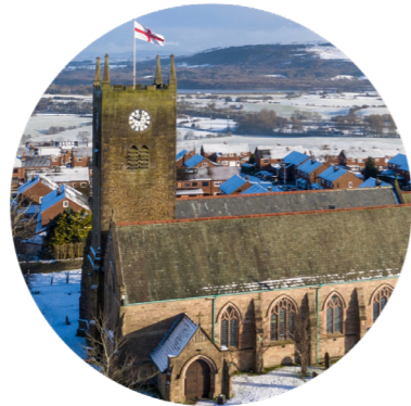
St Katherines Church Church Street, Blackrod, Bolton BL6 5EN