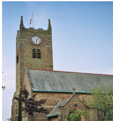
St Katherines Church Church Street, Blackrod, Bolton BL6 5EN