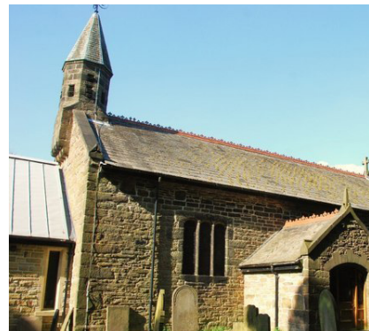
Rivington Church Horrobin Lane, Rivington, Bolton BL6 7SE