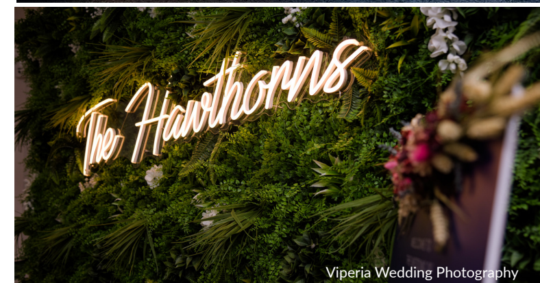
Viperia Wedding Photography