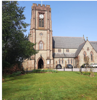
St Paul's Church Railway Road, Adlington, Chorley PR6 9QZ