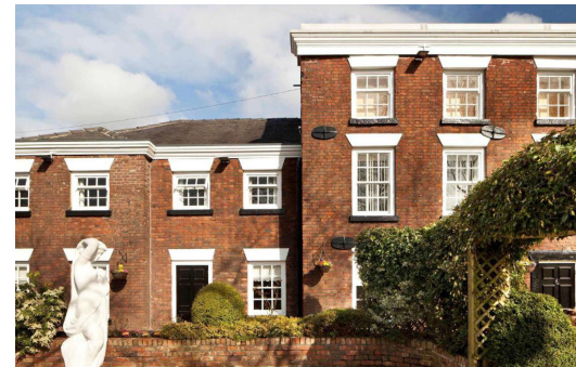
Mercure Bolton Georgian House Hotel Manchester Rd, Bolton, BL6 5RU