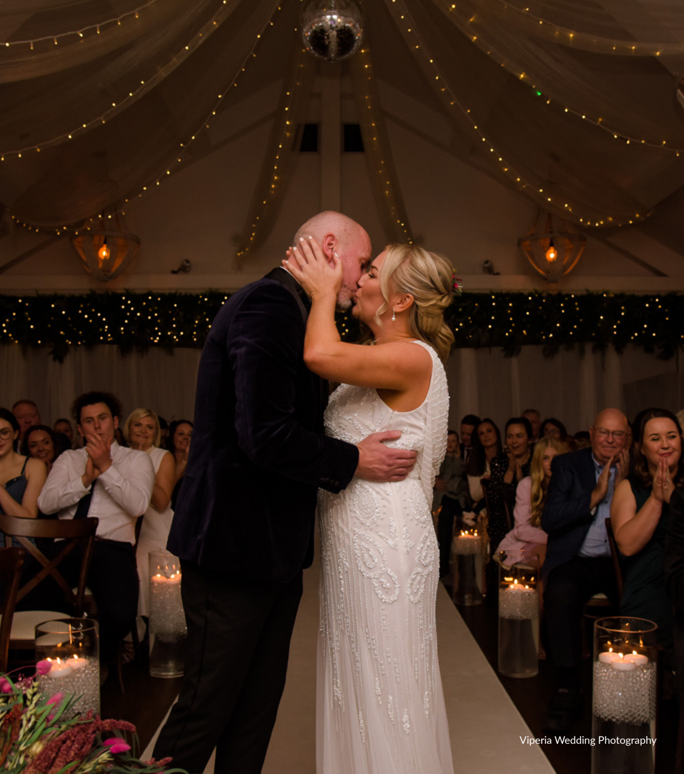
Viperia Wedding Photography